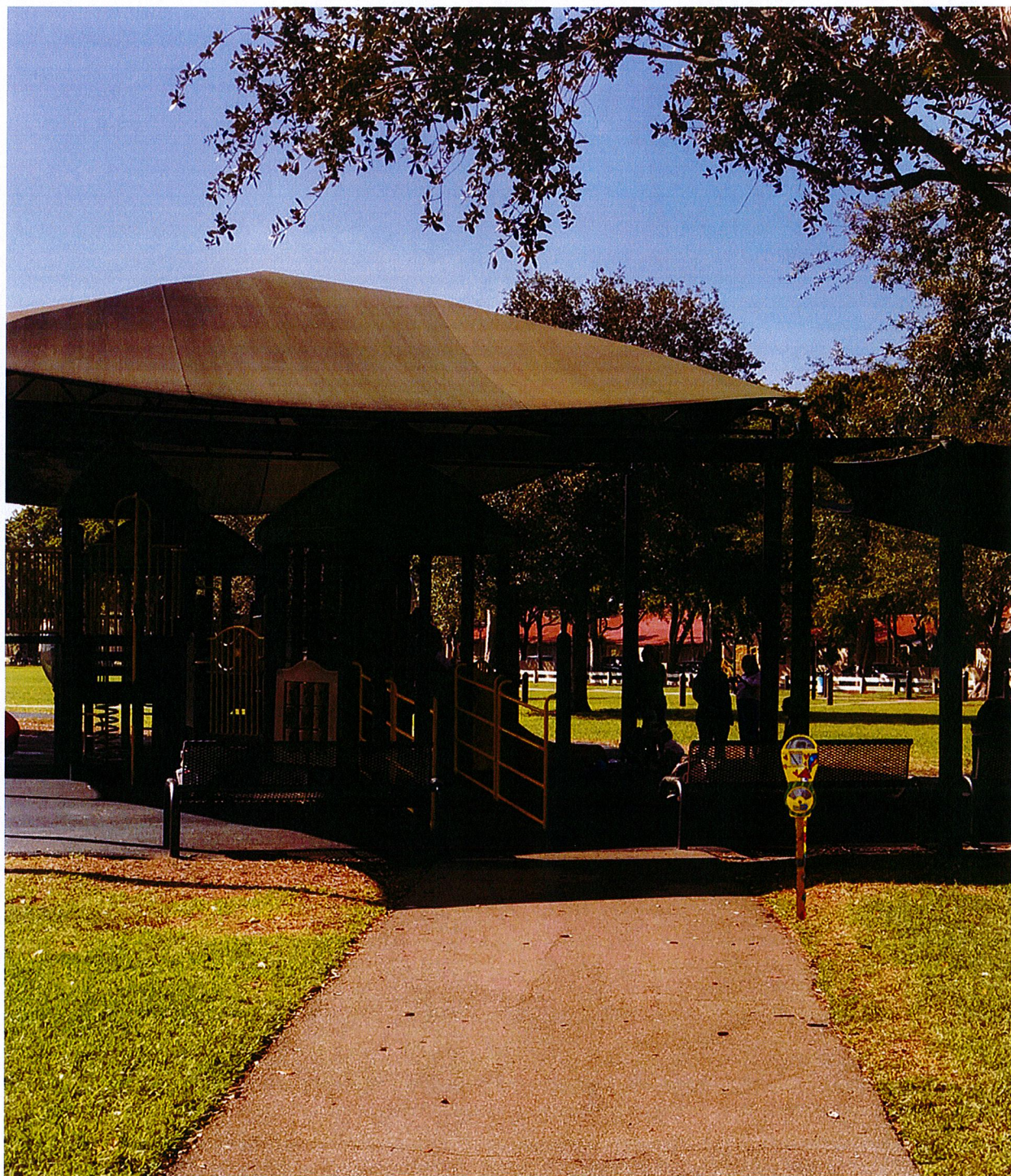
Picnic Park West