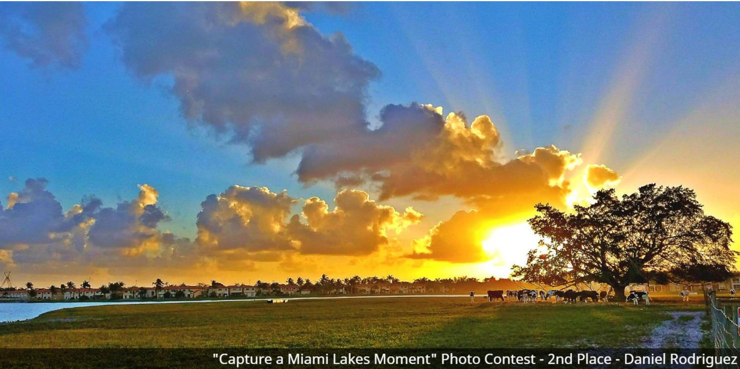
"Capture a Miami Lakes Moment" Photo Contest - 2nd Place - Daniel Rodriguez